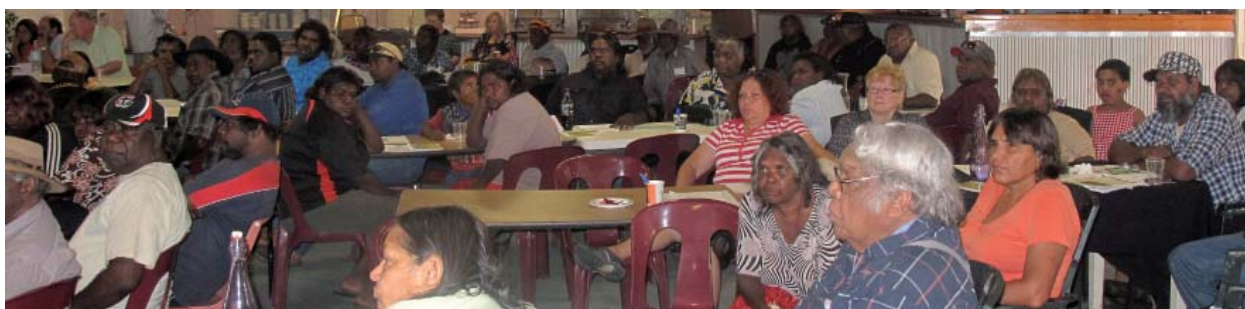
A recent health regional summit, hosted by AMSANT, held in Alice Springs.