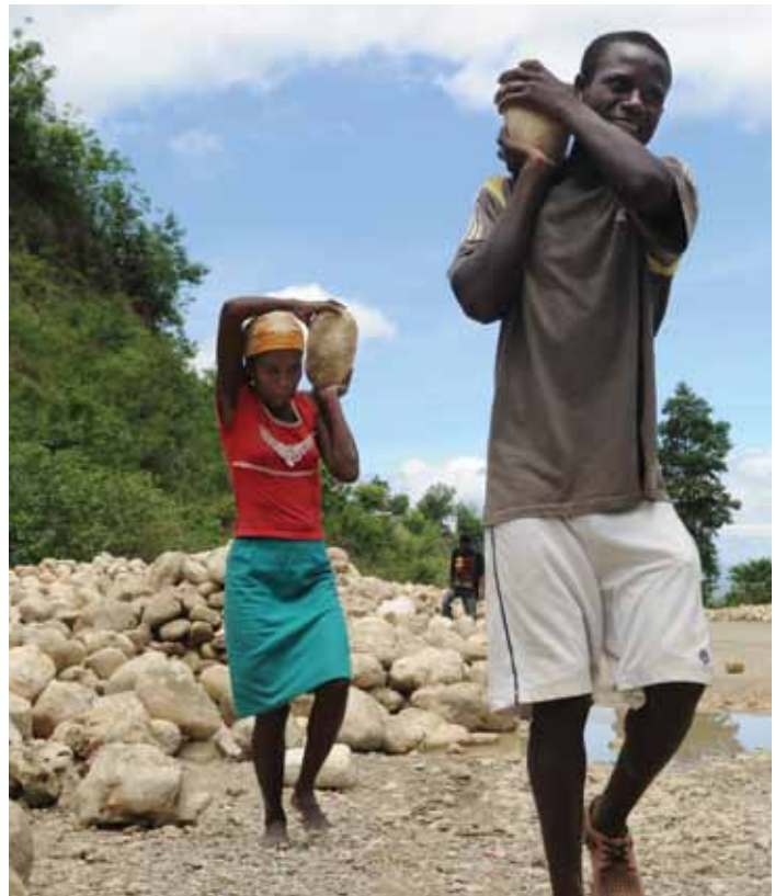
Above: Men and women build stone barriers as part of an Oxfam-funded community project in Los Poetes, Haiti. Designed to prevent soil erosion and control flooding, the project also provides steady work for people displaced by the earthquake.

in the countryside, driving streams of them to the capital in search of a better life. There, slum conditions greet many: built for 250,000, Port-au-Prince had swollen to nearly 3 million residents by the time the quake hit. Many homes have neither clean running water nor sewage facilities—a problem not unique to the capital. Across Haiti, about half the population lacks clean drinking water.